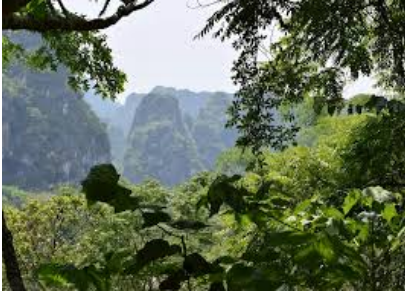
Vietnam-Lao border crossing (Quan son District, Thanh Hoa province)